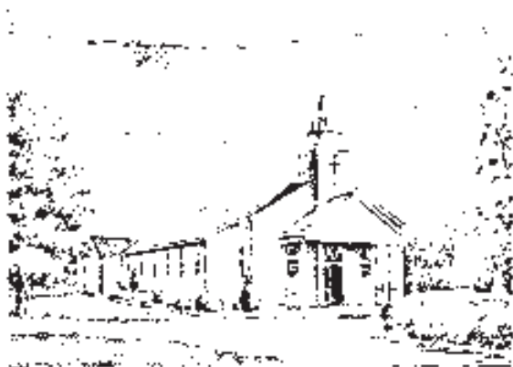
Immaculate Conception 20916 Dalton Road, Box 128, Sutton West, ON L0E 1R0 parish@immaculateconception.on.ca