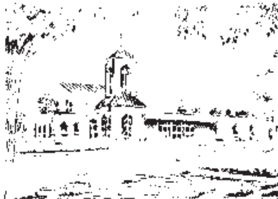
Our Lady of the Lake 129 Metro Road North, Keswick, ON L4P 3C8 Office: 905-476-0097 Fax: 905-476-0897